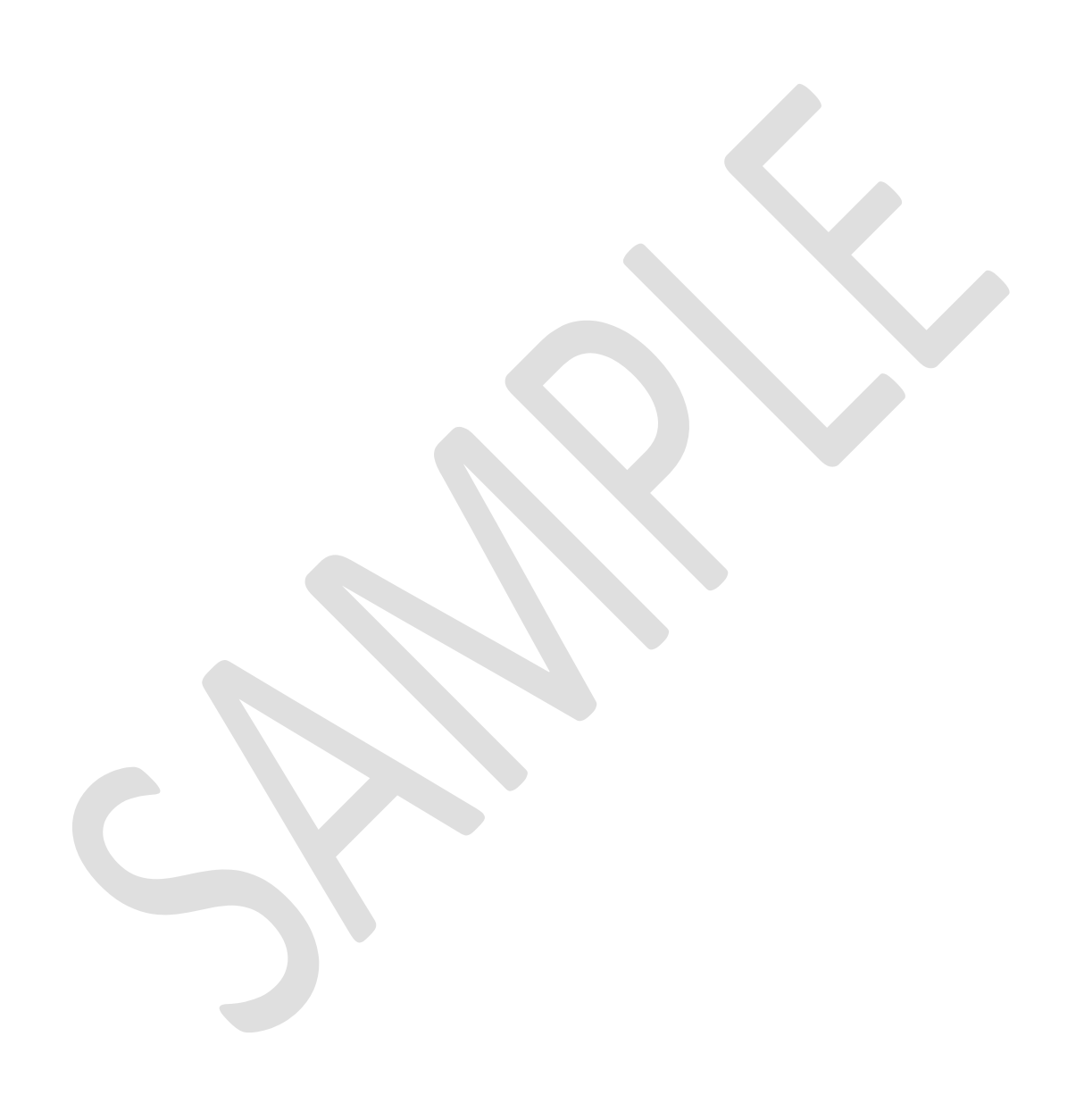
Exhibit 5 Seller Technical Proposal